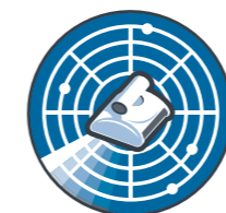
CleaverClean scanning system